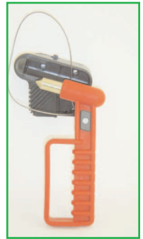
Green/Red with Hand Shield & Retractable Cord