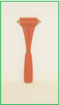
Red T Hammer