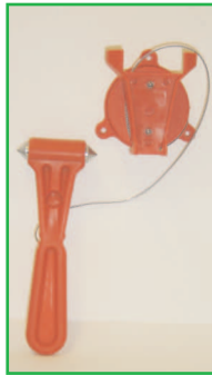
Red T Hammer with Retractable Cord (1.5m/2.2m)