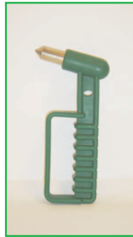
Green/Red Hammer with Hand Shield